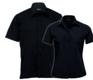
TRSS, WTRSS: BLACK PAGE 62