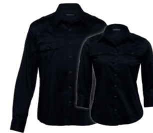
TPL, WTPL: BLACK PAGE 54