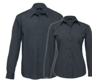
EOE, WEEO: CHARCOAL PAGE 32