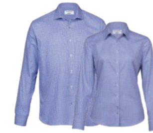
BSC, WBSC: NAVY/BLUE/WHITE PAGE 8