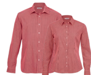
TKC, WTKC: RED/WHITE PAGE 16