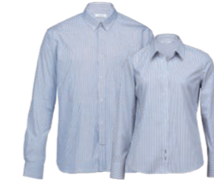
TCDH, WTCDH: WHITE/NAVY/BROWN PAGE 16