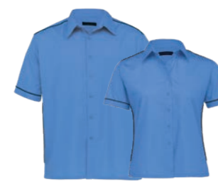
TMT, WTMT: OCEAN/NAVY PAGE 64