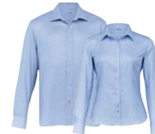
TNP, WTNP: BLUE/WHITE PAGE 28