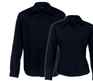
TV, WTV: BLACK PAGE 48