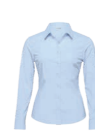
WTMO: EGGSHELL PAGE 58