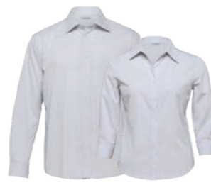
TU, WTU: SILVER/WHITE PAGE 34