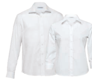
TE, WTE: WHITE PAGE 46