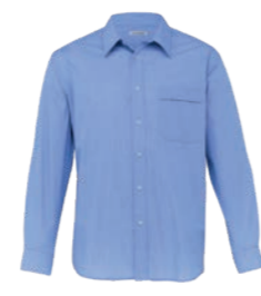
TTBL: BLUE/WHITE PAGE 36