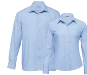
TBC, WTBC: SKY/WHITE PAGE 20