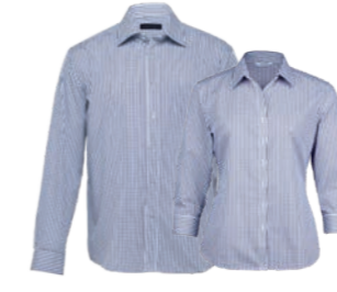
TF, WTF: WHITE/NAVY PAGE 22