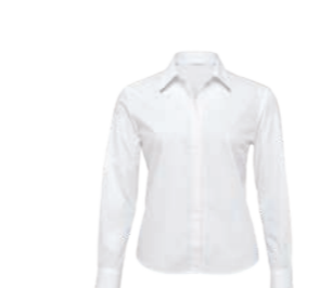
WTEL: WHITE PAGE 44