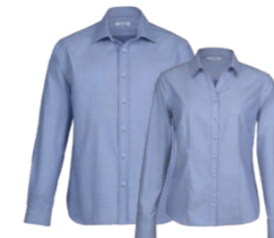
TFL, WTFL: NAVY/WHITE PAGE 30