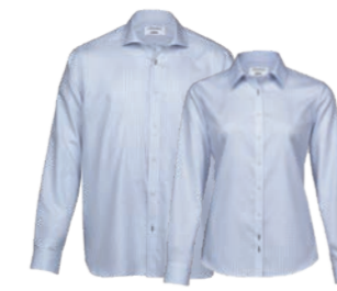
BLC, WBLC: WHITE/BLUE PAGE 4