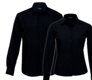
TRLS, WTRLS: BLACK PAGE 50