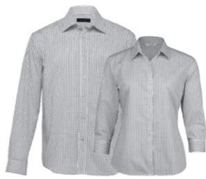
TF, WTF: WHITE/BLACK PAGE 22