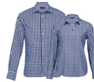
THC, WTHC: NAVY/WHITE PAGE 18