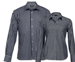
THC, WTHC: BLACK/WHITE PAGE 18