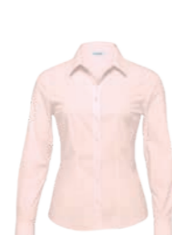
WTMO: PINK BLUSH PAGE 58