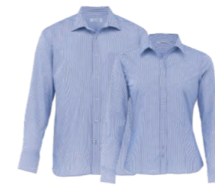
TYS, WTYS: BLUE/WHITE PAGE 38

Our wide range of men's and women's woven shirts offer you a selection of his and her styles to create your working wardrobe. The Standard + Barkers offers coordinating colour pallets to create a cohesive, well tailored look for your business uniform.