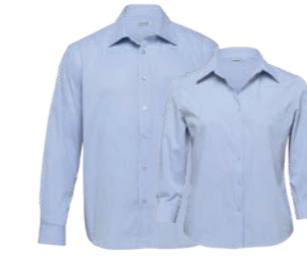
TU, WTU: BLUE/WHITE PAGE 34