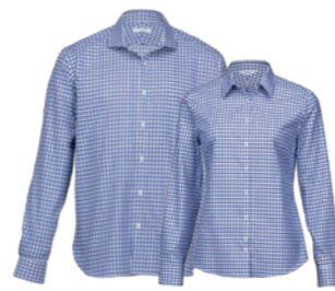
TIC, WTIC: FRENCH BLUE/WHITE PAGE 12