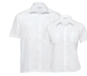
TL, WTL: WHITE PAGE 60