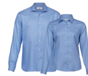
BQU, WBQU: COBALT BLUE PAGE 6