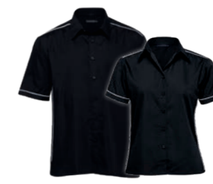
TMT, WTMT: BLACK/WHITE PAGE 64