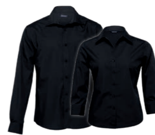
TE, WTE: BLACK PAGE 46