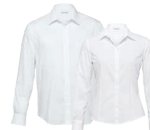
TRLS, WTRLS: WHITE PAGE 50