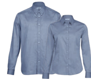
TBT, WTBT: STEEL NAVY PAGE 26