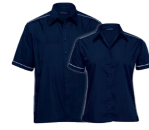
TMT, WTMT: NAVY/WHITE PAGE 64