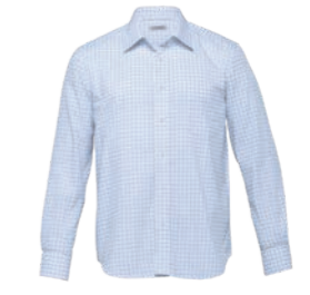
TAX: WHITE/MID BLUE PAGE 24