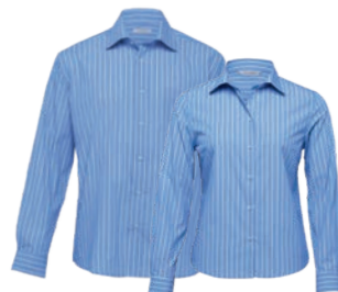
ES, WES: BLUE/WHITE PAGE 42