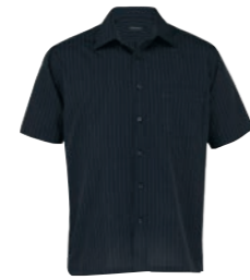
TOSS: BLACK/WHITE/CHARCOAL PAGE 63