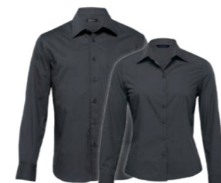
TRLS, WTRLS: CHARCOAL PAGE 50