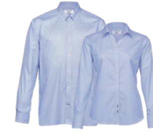
BHC, WBHC: SKY BLUE/WHITE PAGE 10