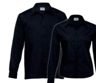
TEL, WTEL: BLACK PAGE 44