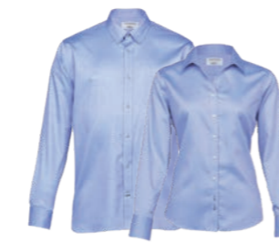
BCL, WBCL: FRENCH BLUE PAGE 2