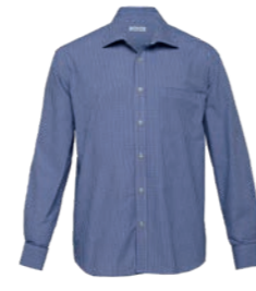
TSC: NAVY/WHITE PAGE 25