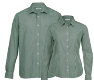
TKC, WTKC: GREEN/WHITE PAGE 16