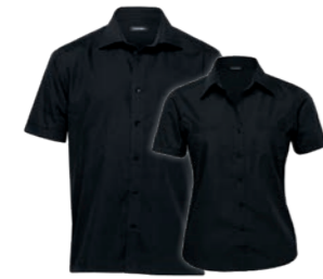
TL, WTL: BLACK PAGE 60