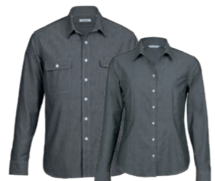
TMC, WTMC: CHARCOAL PAGE 52