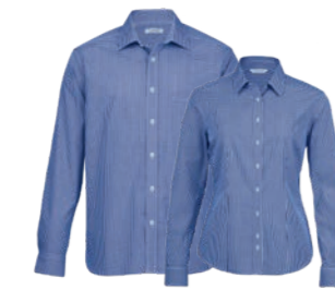
TKC, WTKC: NAVY/WHITE PAGE 16