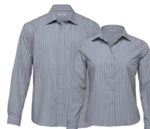
ES, WES: GREY/WHITE PAGE 42