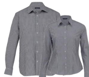
TKC, WTKC: BLACK/WHITE PAGE 16