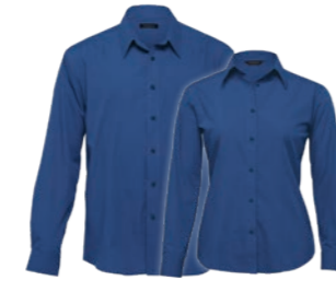
EOE, WEOE: FRENCH BLUE PAGE 32