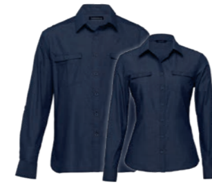
TG, WTG: INDIGO PAGE 56